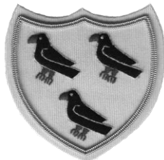
Plate 6 Pilgrimage Chough