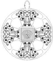
Plate 1 Bronze Past Master Silver Provincial Officer Gold Grand Officer