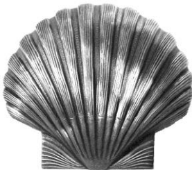
Plate 5 Shell of the Order Hinge down Bronze, Knight & Past Master Silver, holder of Provincial Rank Gold, holder of Grand Rank